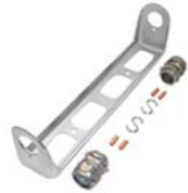
Link Bracket holds fusible link in position over cooking appliance