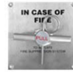
Remote Manual Pull Station activates the system when the handle is pulled